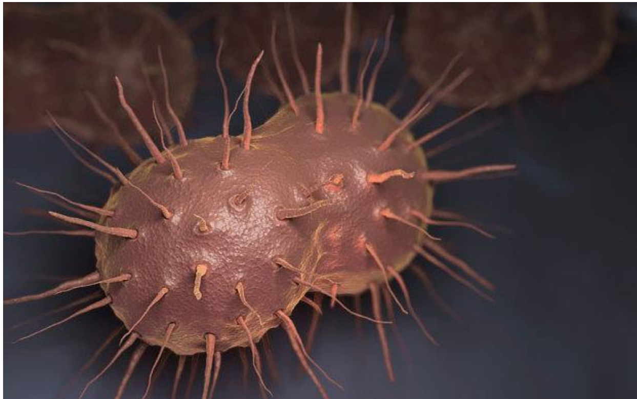
Neisseria gonorrhoeae, the bacterium responsible for the sexually transmitted infection gonorrhea.

The outbreak, which was first detected in Leeds in March, has since spread - with cases reported in patients from Macclesfield, Oldham and Scunthorpe.